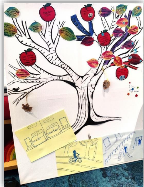
Artwork by The Rights Detectives exploring what they thought the right to a healthy environment should include, such as sustainable travel.

Together supports ERCS’s position . The Rights Detectives have also emphasised the importance of sustainable travel as an aspect of the right to a healthy environment. The Detectives called on Scottish Government to ensure that when implementing the right to a healthy environment that it: ensures that sustainable travel options are accessible to all; acts to address the affordability of electric cars; and encourages environmentally friendly practices. 42 The UN Committee has also urged action on sustainable travel in its recent General Comment 26. 43 Scottish Government should consider how these calls could best be secured.